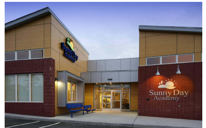
Scope: Site Planning, Site Analysis, Site Investigation Report, Site Capacity Study, Landscape Architecture, Irrigation Plan, Zoning and Permitting Location: Various locations across Ohio